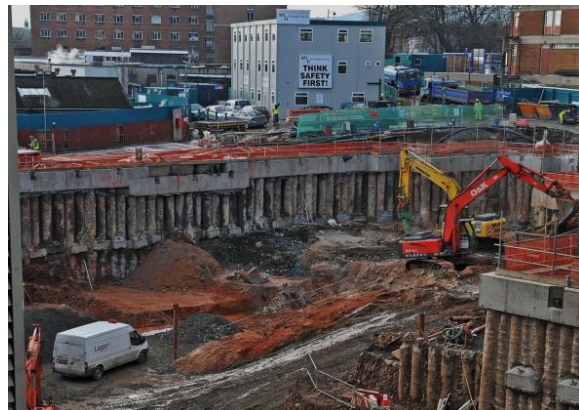
General Civil Engineering