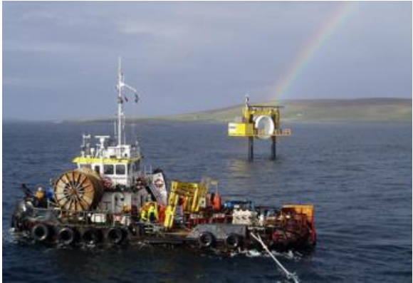
Offshore & Energy