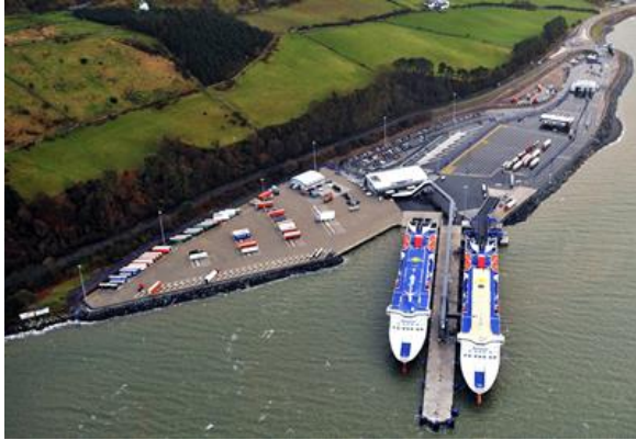
Ports and Harbours