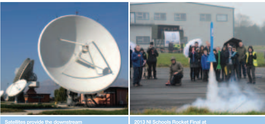
Satellites provide the downstream data for many new applications