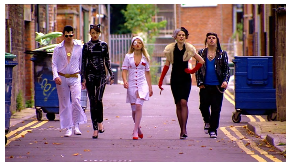
Seacht (winner of Young People's Award at Celtic Media Festival 2009; IFTA nominated)