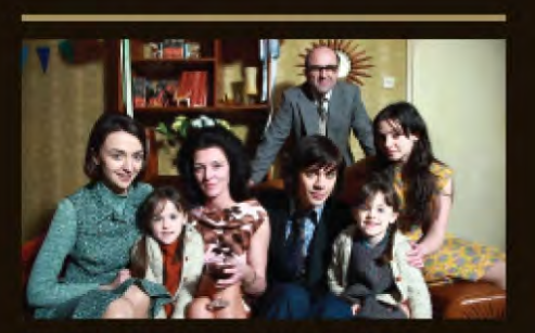
BEST: HIS MOTHER'S SON from DoubleBand Films for BBC2