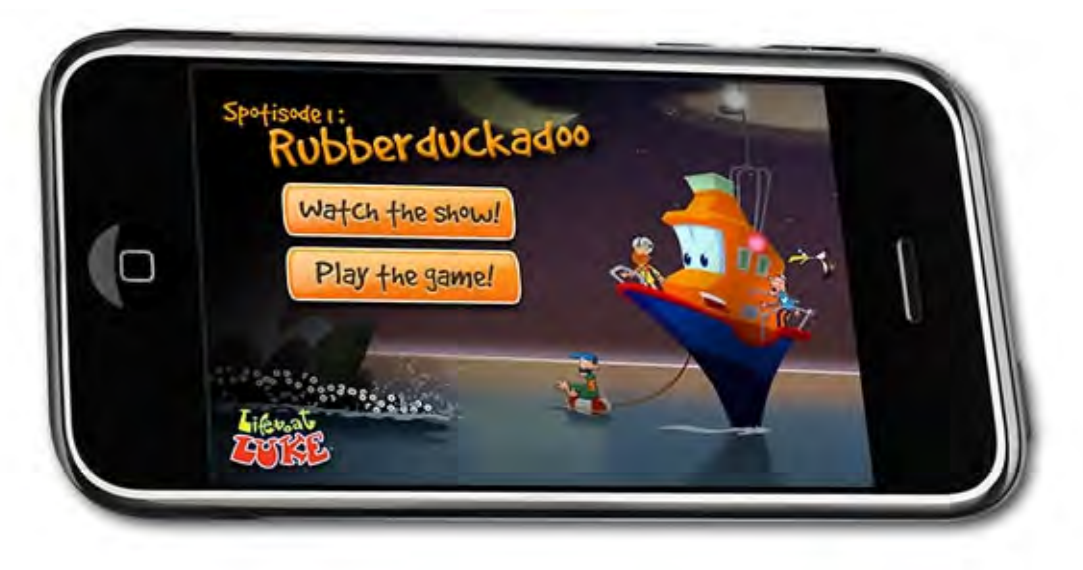
Lifeboat Luke iApp from Straandlooper Animation