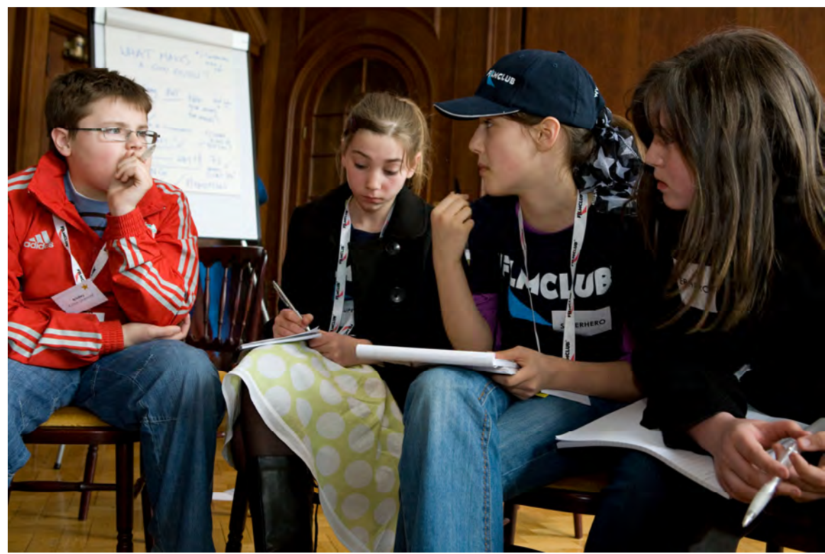
Children from Northern Ireland schools took part in the Film Club Sparks Day in London