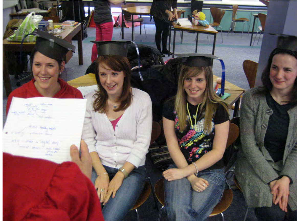
PGCE students at the University of Ulster, Coleraine, during a digital storytelling workshop