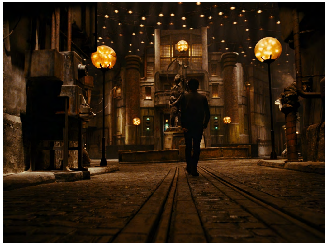
Doon Harrow (Harry Treadaway) walks through Harken Square in City of Ember