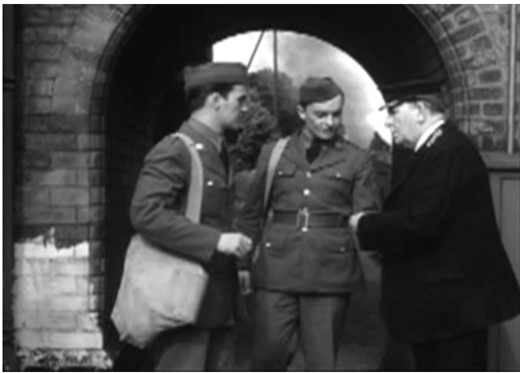
A letter from Ulster (1944) WWII footage from the Digital Film Archive