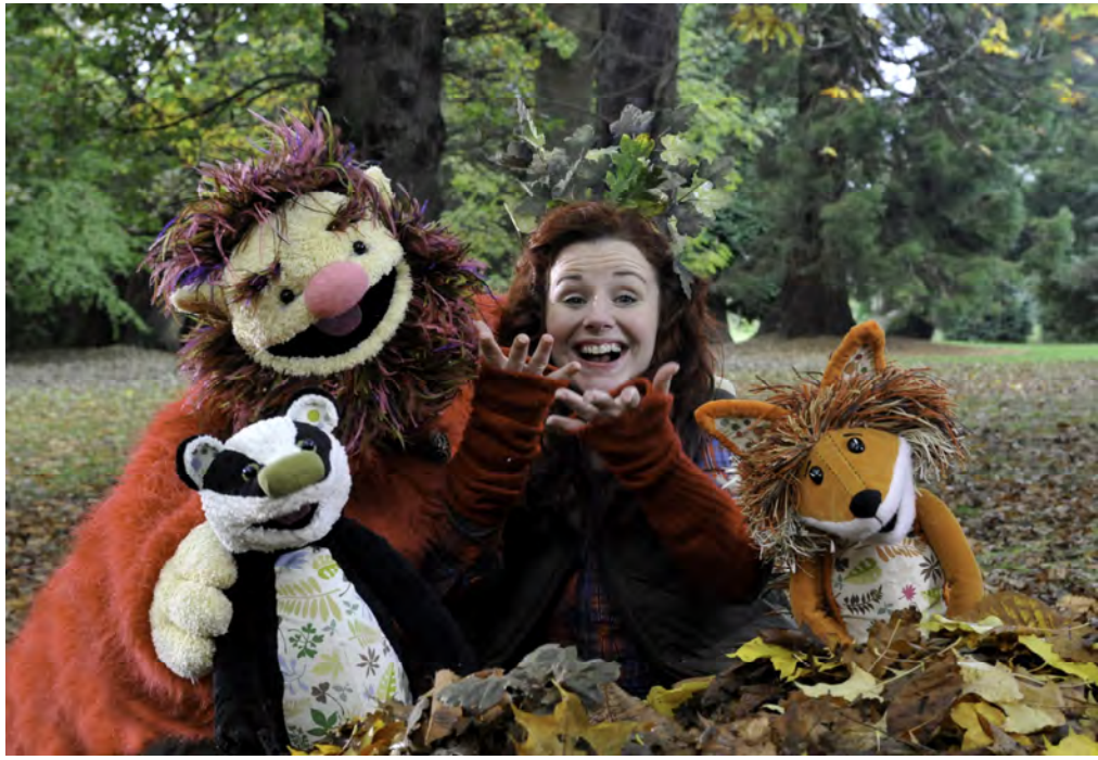
Big City Park produced by Sixteen South for CBeebies from Ormeau Park, Belfast