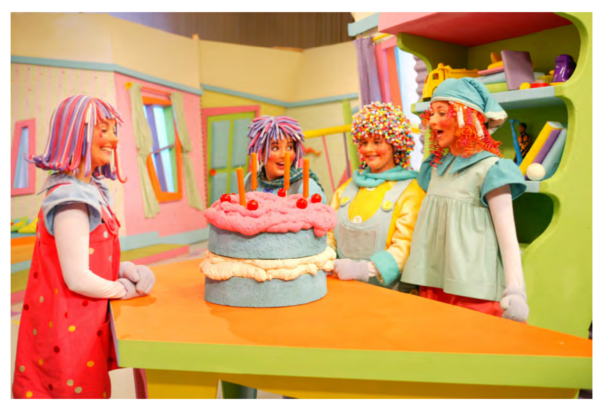
Na Dódaí (winner of Education Award at Celtic Media Festival 2009)