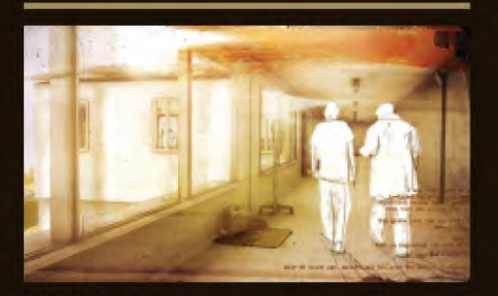
MALARIA from Flickerpix Animation for BBC1 Comic Relief