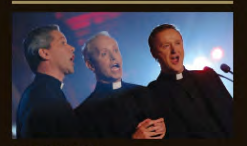
THE PRIESTS from Waddell Media for ITV1