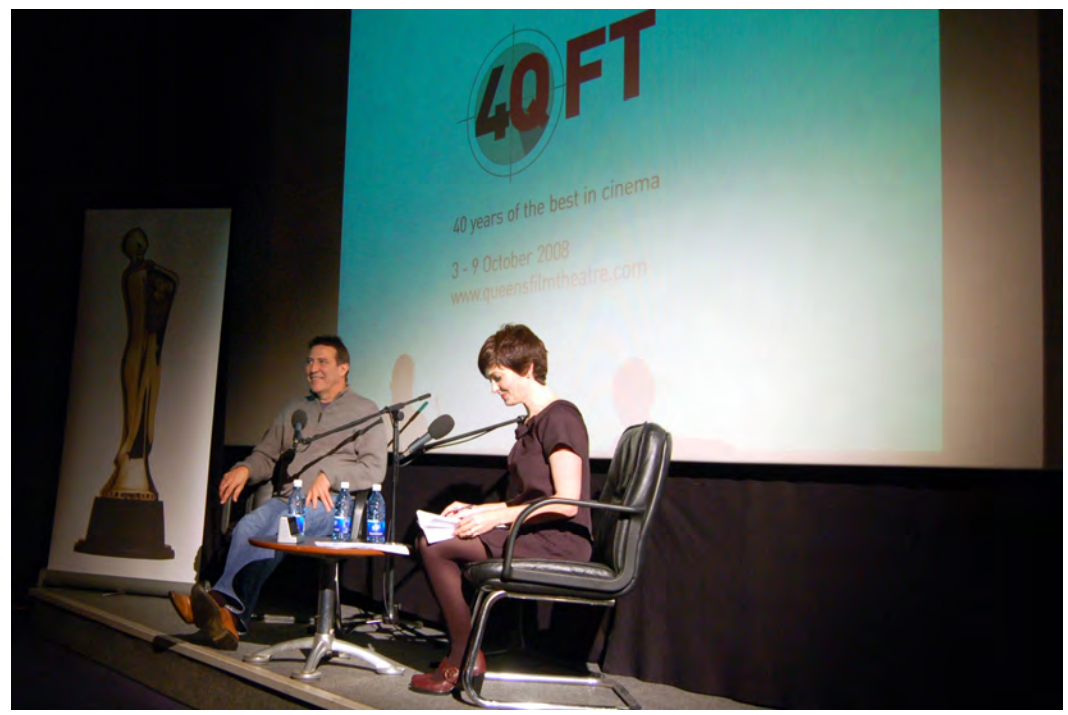
Ciaran Hinds' interview at Queens Film Theatre