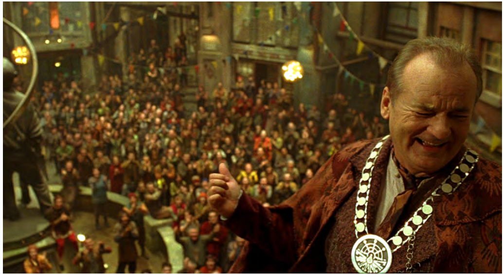
Bill Murray as Mayor Cole on the set of City of Ember in the Paint Hall