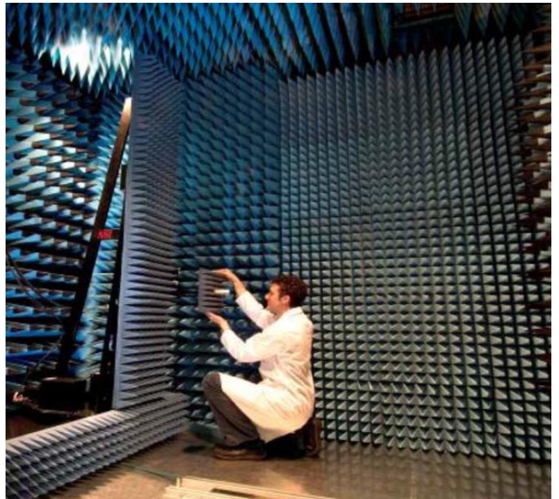
ECIT planar 1.5m near-field scanner QUB - Institute of Electronics, Communications & Information Technology