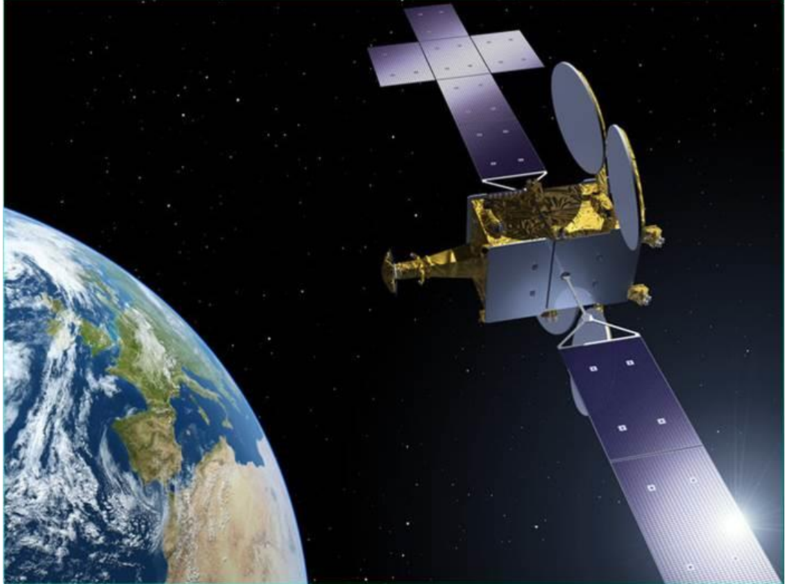
SpaceBus NEO, platform for NEOSAT programme