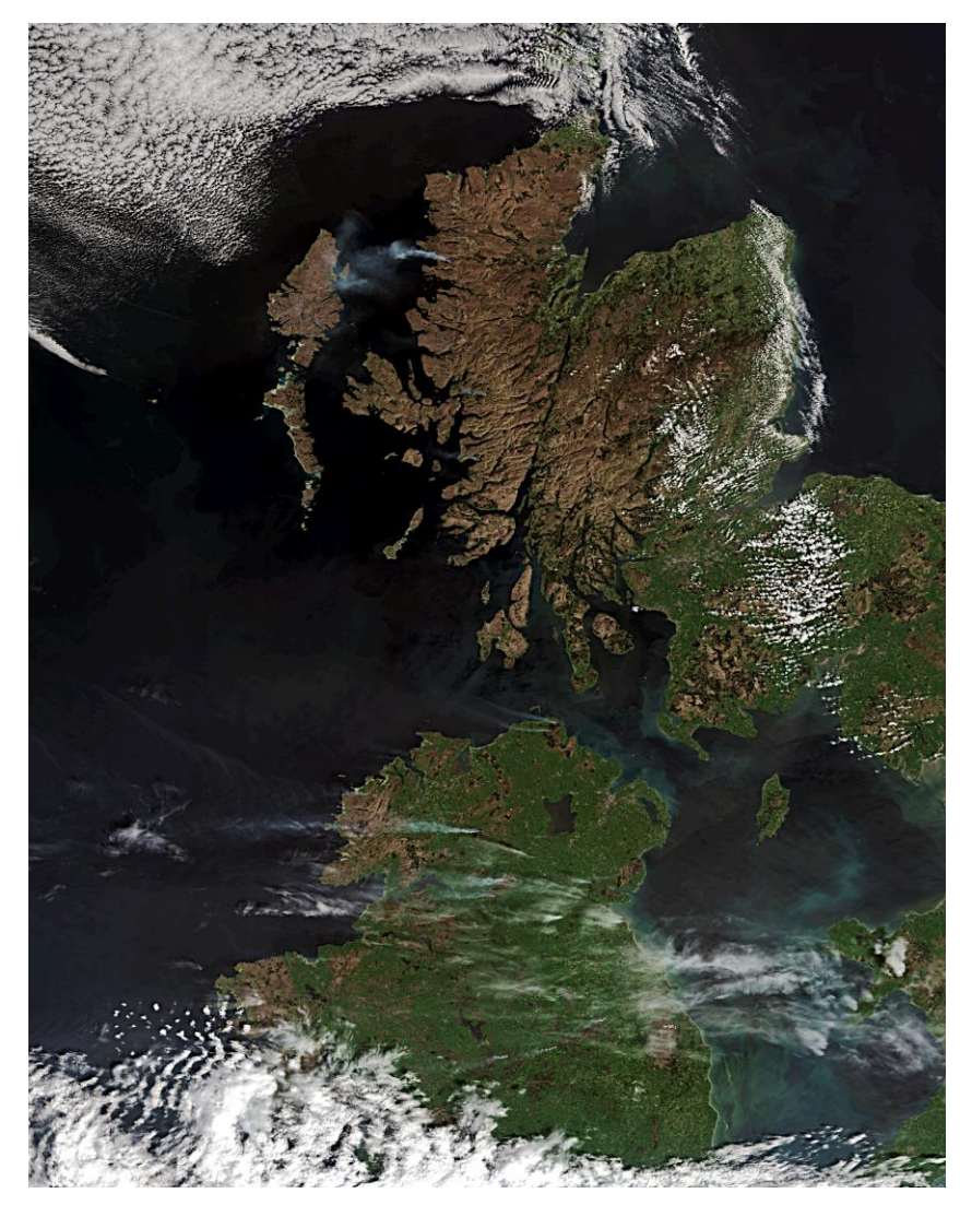
Envisat Image - NI & Scotland from Space