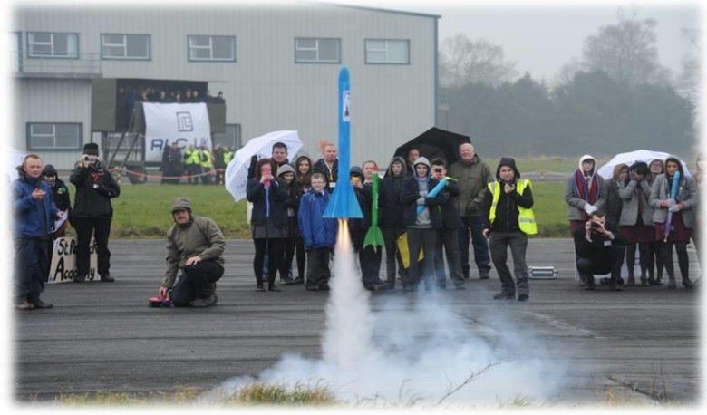
Schools competing at Northern Ireland Rocket Challenge at RLC

By nurturing and inspiring curiosity in our students, with an understanding of regional industry and research future skills requirements, we can use the context of space to encourage and motivate students to consider STEM pathways and careers.